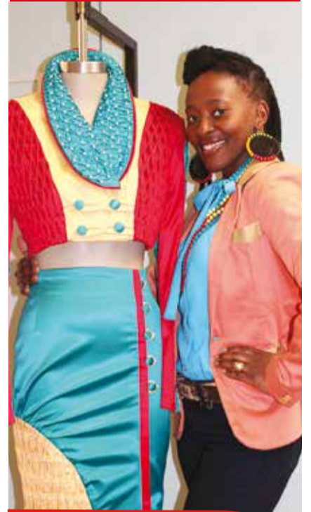
EXTRAVAGANZA: A fashion student with one of the designs that will be featured

Third year fashion students are placing their final touches on their collections which will be showcased at the CPUT annual Fashion Show extravaganza.