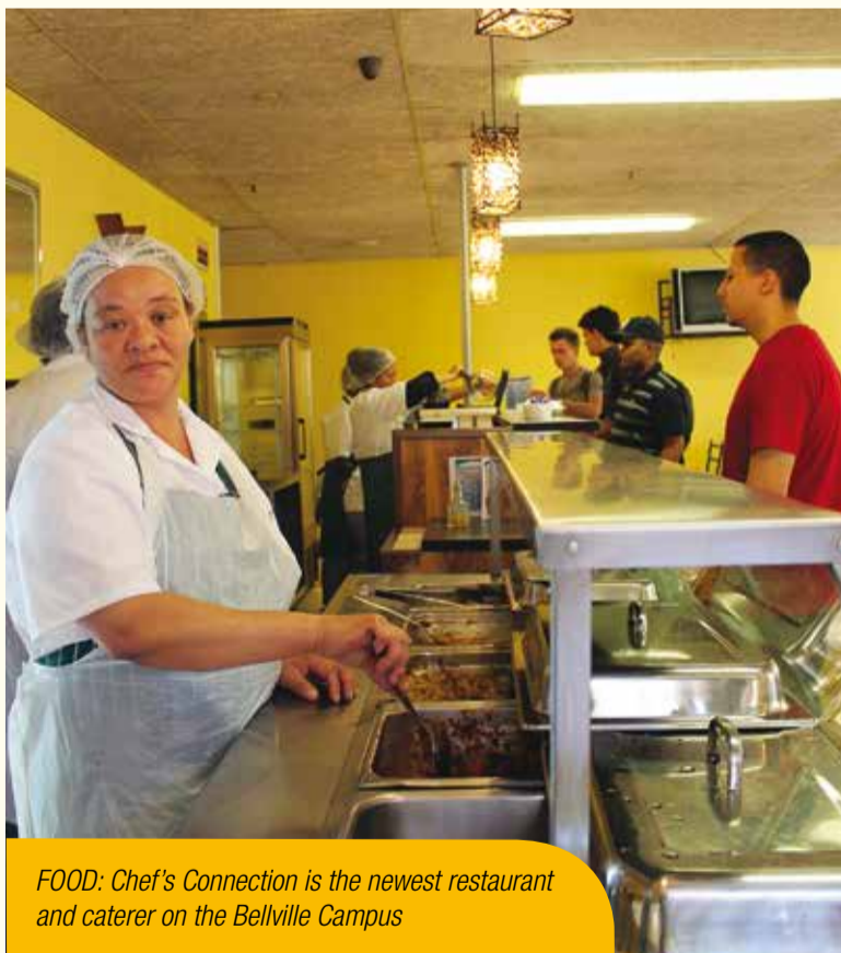
FOOD: Chef's Connection is the newest restaurant and caterer on the Bellville Campus

However, Chef's Connection's signature product is cakes. Staff and students can