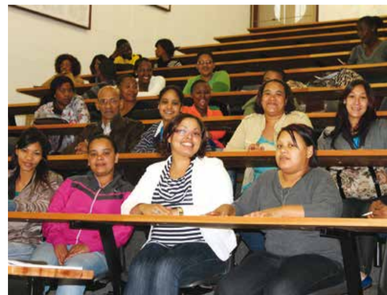
WELL PREPARED: The Spring School class

To keep students focused on their studies during the recent vacation, the Department of Public Management organised a Spring School.