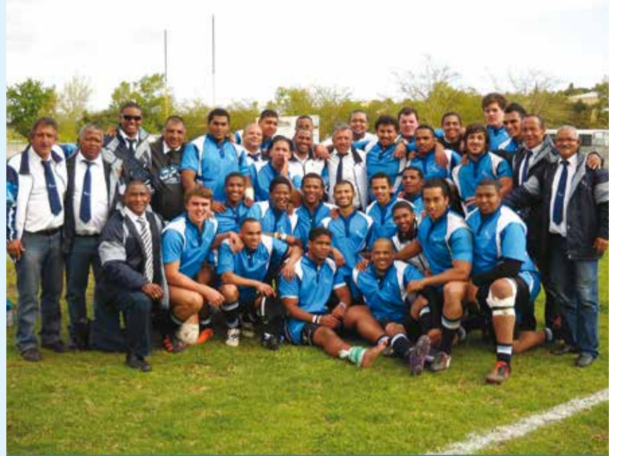
CHAMPIONS: The CPUT rugby team is on a winning streak

In October, the team played their final league match against the Villagers in Wellington and won 31-3, earning the title of League Champions for 2012.