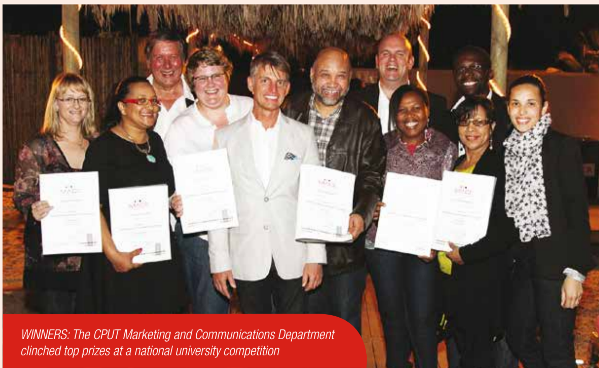
WINNERS: The CPUT Marketing and Communications Department clinched top prizes at a national university competition

It also clinched the highest overall marks for the