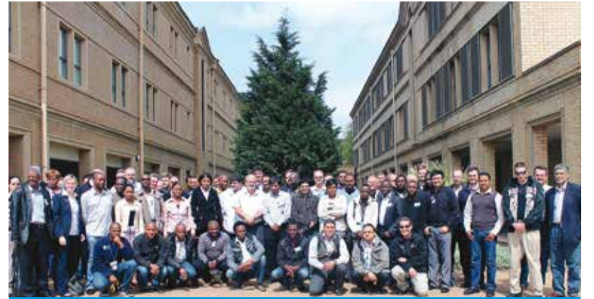
TRAINING: Members of industry who attended the seminar

The Electrical Engineering Department is fast becoming the national authority on all matters related to substations.