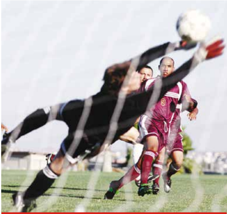
GAMES: Students showed off their sporting skills at the Mini-Olympics

CPUT students got the opportunity to show off their sporting skills at the Residence Mini-Olympics.