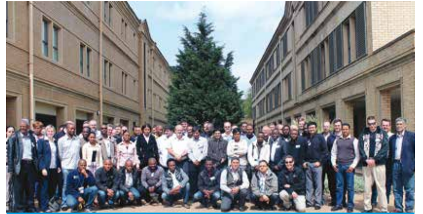
TRAINING: Members of industry who attended the seminar

The Electrical Engineering Department is fast becoming the national authority on all matters related to substations.