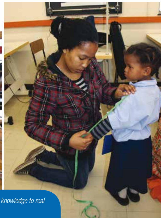
HELP AT HAND: Service learning students apply theoretical knowledge to real life situations