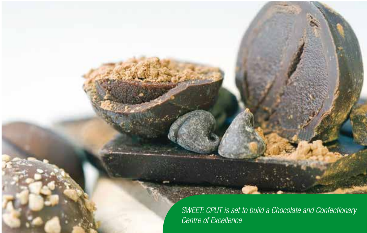
SWEET: CPUT is set to build a Chocolate and Confectionary Centre of Excellence

Currently training in this specialised area is only offered abroad, forcing local companies to spend huge sums on training courses.